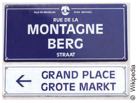
The photograph here is of a street address in Belgium. You will notice that place names and directions in two languages – French and Dutch.